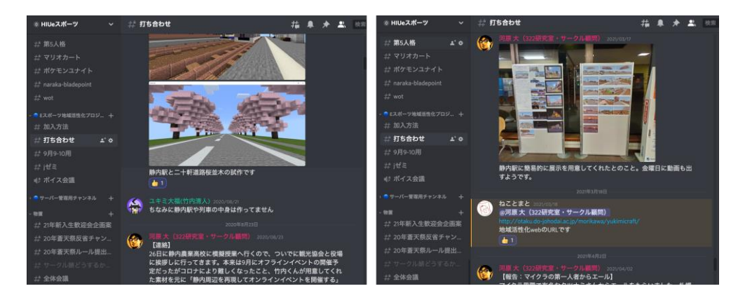
Figure 2. A faculty member interacting with students on Discord.

has screen sharing and voice communication functions, therefore, they were able to share the photos and Minecraft screenshots they took on Google Drive. They were able to communicate with each other easily by using online communication tools and increased their online communication skills. Figure 2 shows Discord screens. The faculty members instructed that the students should report progress by uploading images and should create a list of productions. What the faculty members wanted students was to communicate spontaneously.