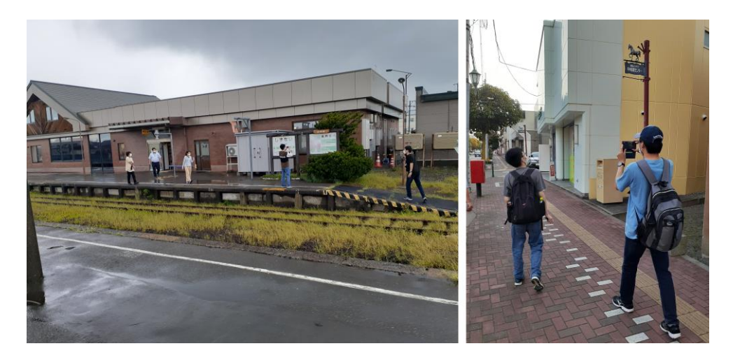
Figure 1. Students taking photos in Shinhidaka Town.

In September 2020, 5 students visited Shinhidaka to check the detailed streets, which cannot be seen on Google Maps and Street View. They also visited the town hall and discussed with the town hall staff which buildings to reproduce. They took photos of buildings and scenery in the town. Figure 1 shows the students taking pictures of the town. This was the only opportunity for the students to interact with the locals face-to-face. Based on the photos they took, they began reproducing the townscape. They gathered and discussed every weekend on a server on Minecraft.