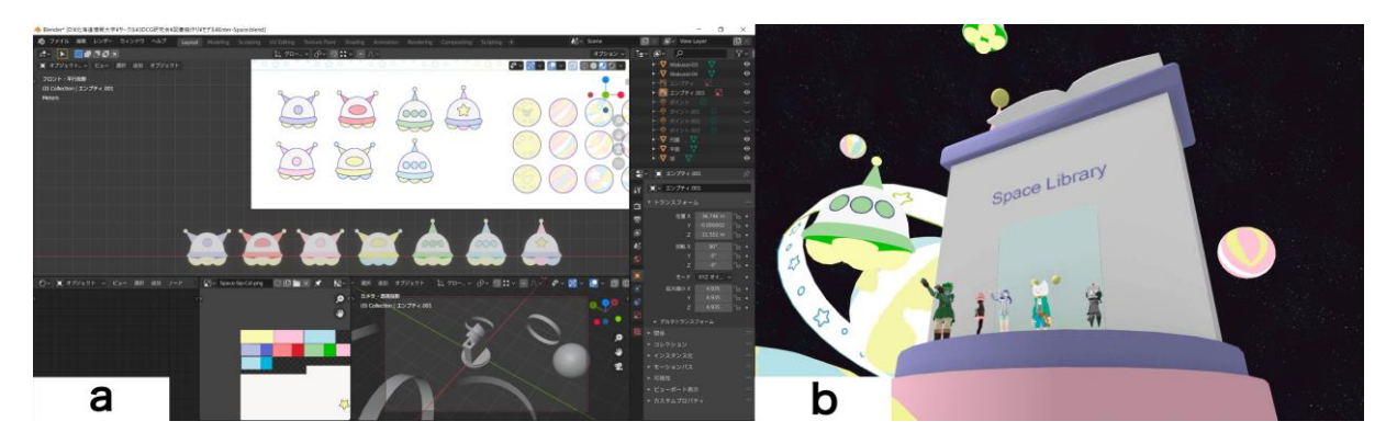
Figure 7. (a): 3D modeling of characters, (b): Meeting with students in "cluster."