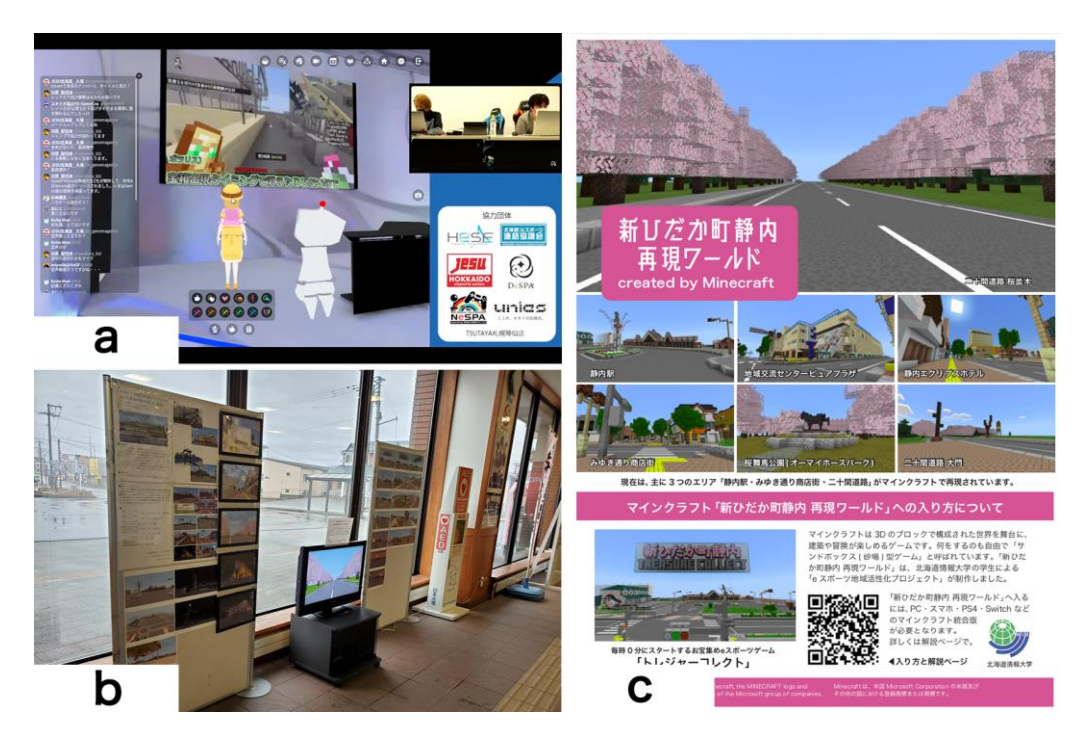
Figure 4. (a): e-sports online event, (b): display at the tourism center, (c): leaflet design.