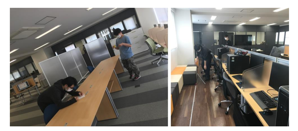
Figure 5. Students taking measurements in the library.

The second example is a project to reproduce local libraries online. Due to COVID-19, citizens lost their opportunities to visit libraries because local libraries were closed. Libraries wanted to stay connected with citizens, even when they were closed.