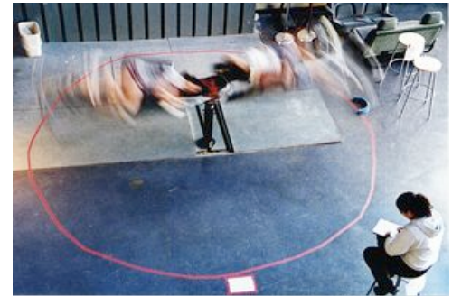
Engineering learning environments must include spaces for students to operate their own experiments.

CDIO is an improvement process requiring rigorous assessment that guides the educational reform process. The assessment element developed as part of the CDIO Initiative evaluates individual student learning and overall impact of the entire educational initiative.