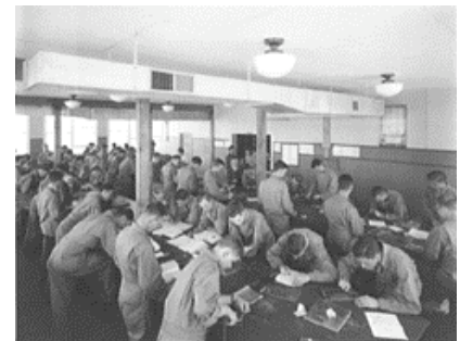
American engineering students hone their hands-on skills during the 1940s.

Aware of the growing tension between scientific and practical engineering demands, an international group of university engineering academics took up the challenge to reform engineering education. The result of that endeavor is the CDIO Initiative.