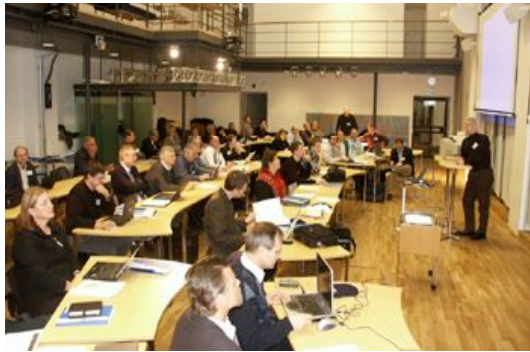
CDIO collaborators from around the world meet regularly to pool their ideas.

CDIO was conceived at the Massachusetts Institute of Technology in the late 1990s. In 2000, with funding from the Wallenberg Foundation, Chalmers Institute of Technology, Linköping University, and the Royal Institute of Technology (KTH), all of Sweden, collaborated with MIT to form the CDIO